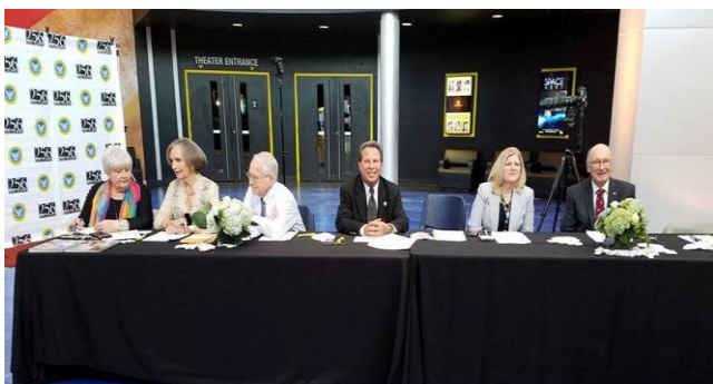
Registration Table staffed with NASA docents and USRC Staff