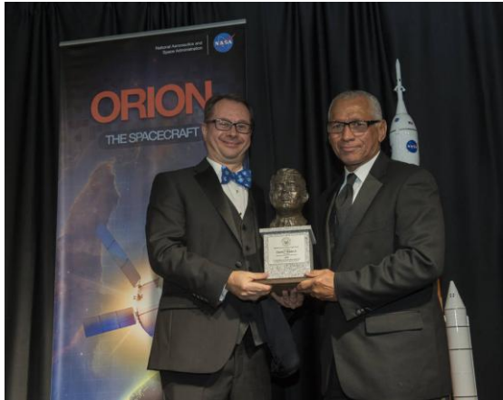
NASA Administrator Charles Bolden with von Braun Trophy

The 28 th Annual Wernher von Braun Memorial Dinner was held on October 27, 2016 at the Space & Rocket Center under the magnificent Saturn V rocket. Over 800 NASA employees, retirees and contractors attended the dinner. NASA Administrator Maj. Gen. Charles Frank Bolden Jr., received the coveted Dr. Wernher von Braun Space Flight Trophy.